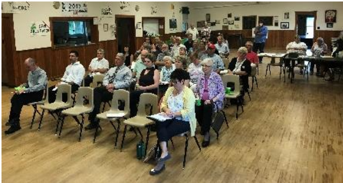
The 42nd Annual General Meeting in Arden.