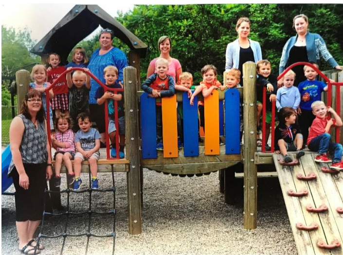
Graduating Class of 2018