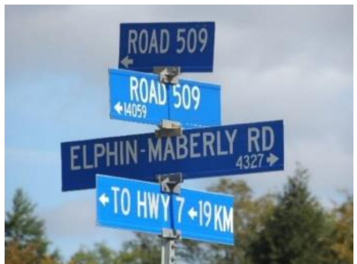
Our drivers know where they are going!